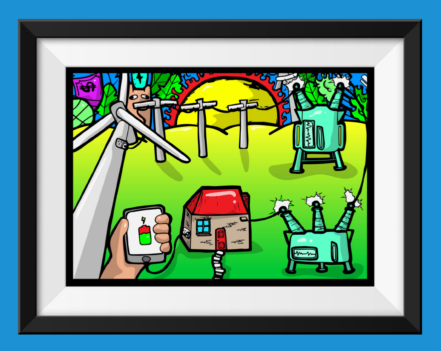
Artwork piece by Tomoki Harvey aged 14 July 2020 Take a look at our Art Space on our website: Click Here